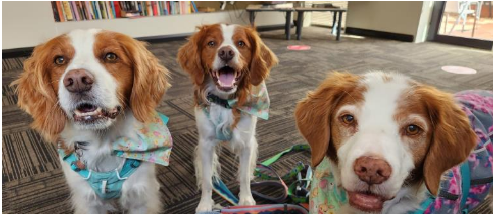
Faith, Teddy and Baloo celebrating Easter at Ambulance Tasmania