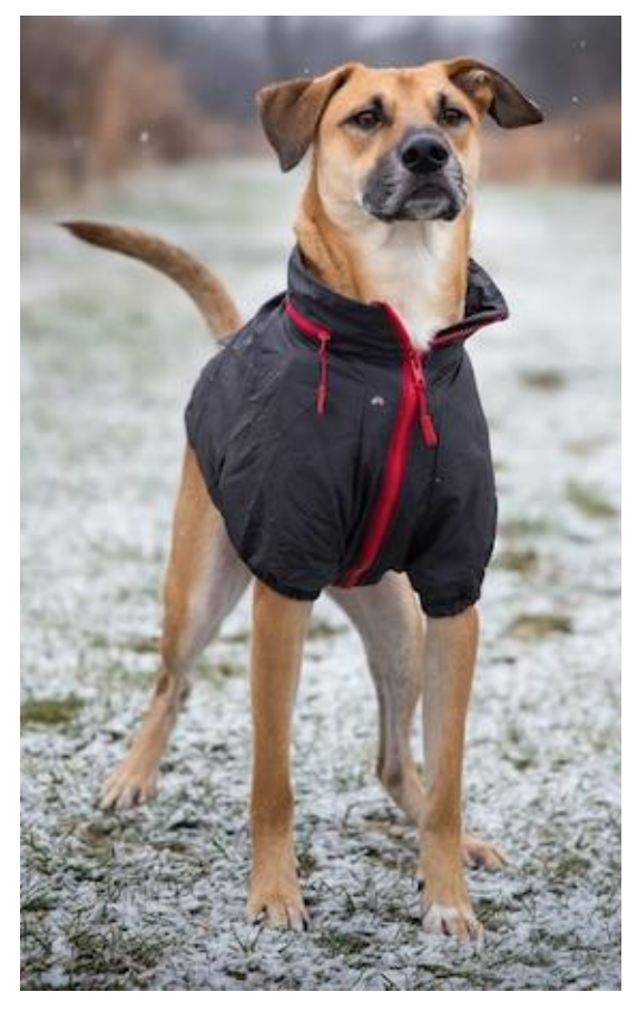
He's a smart fellow in his new winter coat!

Our new walks schedule is on Page 6. What a great variety of locations for early winter including forest walks, a beach and a couple of town walks, something for everyone - and their dog! Why not join us and enjoy exploring lovely places in the Huon Valley.